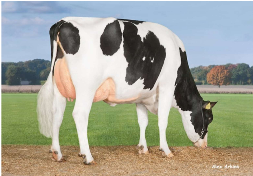
Mother: DG Caley VG 87